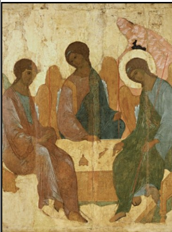
The Trinity Andrei Rublev (1370-1430) Moscow

In Andrei Rublev's icon, the persons of the Holy Trinity are shown in the order in which they are confessed in the Credo. The first angel is the first person of the Trinity - God the Father; the second, middle angel is God the Son; the third angel is God the Holy Spirit. All three angels are blessing the chalice, in which lies a sacrificed calf, prepared for eating. The sacrifice of the calf signifies the Saviour's death on the cross, while its preparation as food symbolizes the sacrament of the Eucharist. All three angels have staffs in their hand as a symbol of their divine power.