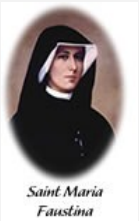
Saint Maria Faustina

Mark 7:1-8, 14-15, 21-23 Jesus said that nothing coming from outside can make a person impure. Rather, it is the evil coming from within that constitutes impurity.