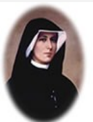
Saint Maria Faustina

Matthew 4:23 A deaf man with a speech impediment was brought to Jesus who healed him. Jesus ordered the crowds to tell no one, but they went about proclaiming the Lord's wonders.