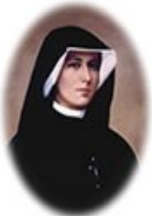
Saint Maria Faustina

On the Second Sunday of Easter of the Jubilee Year 2000, at the Mass for the canonization of St. Faustina Kowalska, Pope John Paul II proclaimed to the world that “from now on throughout the Church this Sunday will be called Divine Mercy Sunday.”