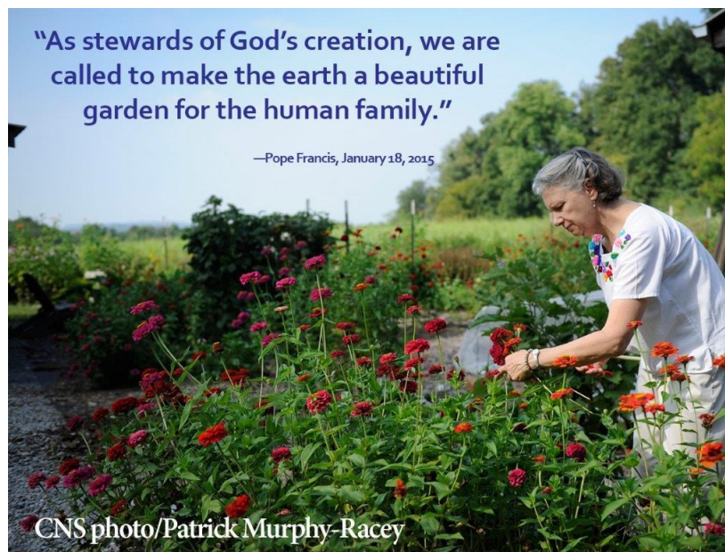
Quote by Pope Francis, January 18, 2015