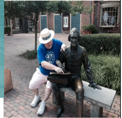
Offering advice to Thomas Jefferson.