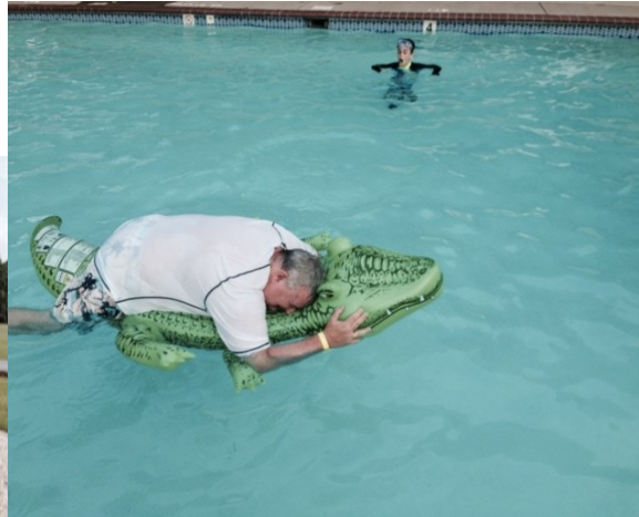
Your pastor wrestles an alligator!!