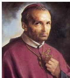
Saint Alphonsus Liguori - 1696 - 1787 Founder of the Redemptorists

Moral theology, Vatican II said, should be more thoroughly nourished by Scripture, and show the nobility of the Christian vocation of the faithful and their obligation to bring forth fruit in charity for the life of the world. Alphonsus, declared patron of moral theologians by Pius XII in 1950, would rejoice in that statement. In his day, Alphonsus fought for the liberation of moral theology from the rigidity of Jansenism. His moral theology, which went through 60 editions in the century following him, concentrated on the practical and concrete problems of pastors and confessors. If a certain legalism and minimalism crept into moral theology, it should not be attributed to this model of moderation and gentleness.