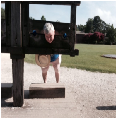
I managed to get in trouble!