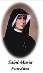
Saint Maria Faustina