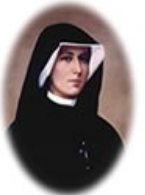
Saint Maria Faustina