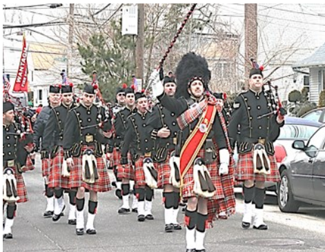
FDNY Emerald Society Pipes & Drums

Reception immediately following the parade St. Martin of Tours Emmaus Hall Auditorium and Cafeteria