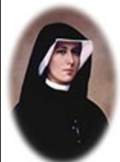
Saint Maria Faustina

I do carry a very painful moment about the sacrament of reconciliation from many years ago. I was a few years into my priesthood, filling in at a city hospital. I stopped by to visit a woman in intensive care and asked her if she would like to receive the sacraments. She was an older woman and I saw a tear roll down her cheek. In a hesitant manner she told me her story: when she was a young woman fifty years ago, she found herself in a marriage that had not been blessed by the church for whatever reason. The priest told her she was a pig and that she could not receive absolution. For fifty years that woman was deprived of the Eucharist and the rest of the sacraments! Her spouse was long dead. Finally she was able to celebrate reconciliation and the anointing of the sick. I never saw her again but I have never forgotten that heart-breaking moment. I wondered about the priest and prayed for him. Was he so caught up in the laws of the Church that all compassion and mercy was forgotten? I wondered if he was at fault or the Church that formed him. I have many sins and faults but I have tried very hard, as I think is true for almost all priests, to be men of mercy in the confessional.