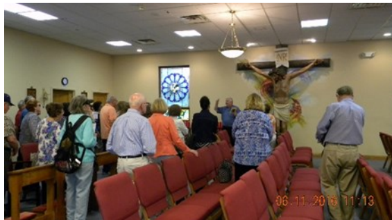
The Mercy of God