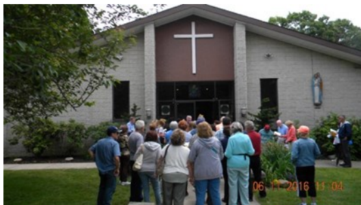
Entering the Holy Doors