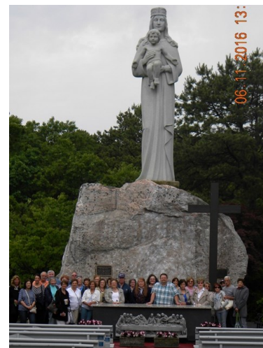
Our Lady of the Island, bless us!