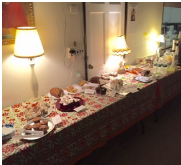
St. Clement Bakers Table