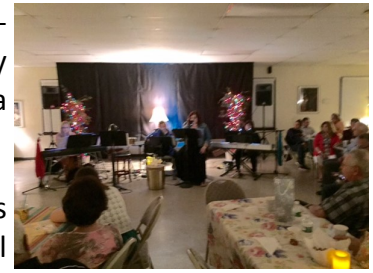
A great night enjoyed by all.