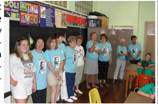
What a great staff!