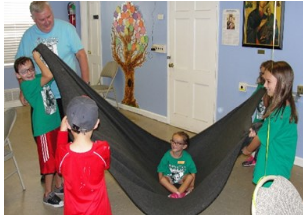
Carrying the wounded to Jesus