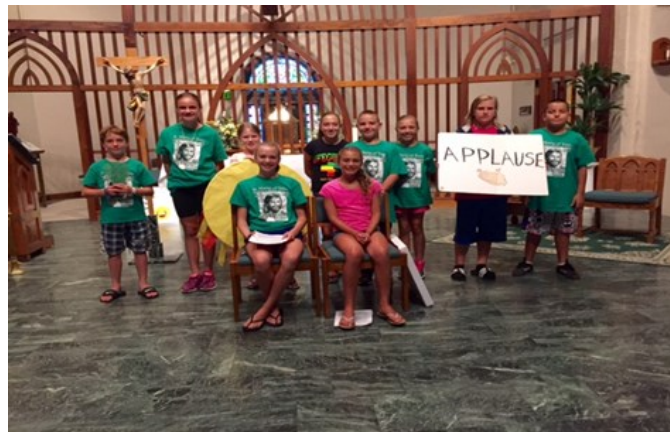
The evening children practicing the play.