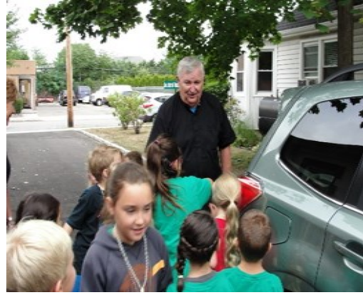
The blessing of the car!