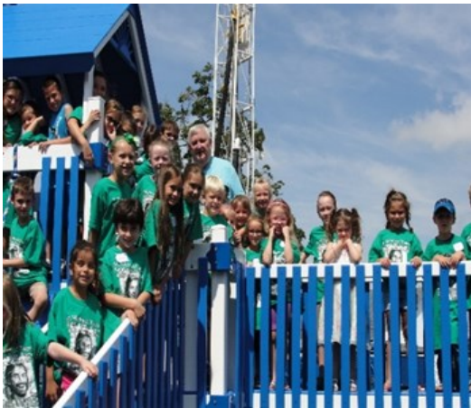
I need an elevator!