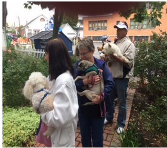
Even our parish cats and dogs love one another!