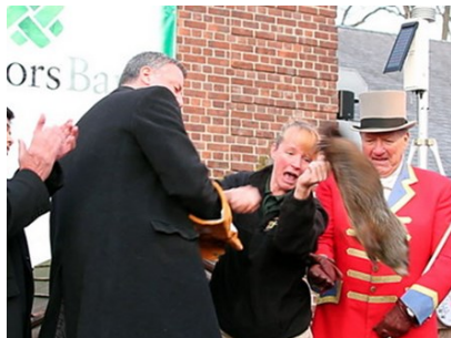
Mayor DeBlasio, left, winces as Staten Island Chuck breaks free and drops to the stage during the 2014 Groundhog Day ceremony at the Staten Island Zoo.

The Redemptorists ask your prayers for our seminarians as they discern their vocations as Redemptorist priests or brothers. Below is the list of all seminarians from the communities of Boston, The Bronx, Chicago, Houston and Toronto: