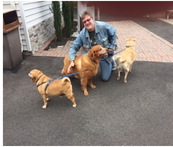
Four envelope-using parishioners