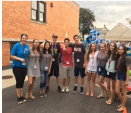
Youth Ministry Helpers