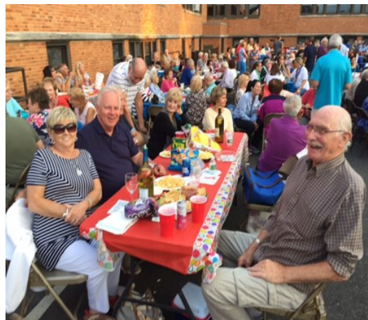
A Great Parish Party!!!