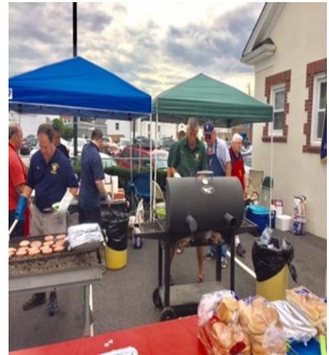
Knights of the BBQ