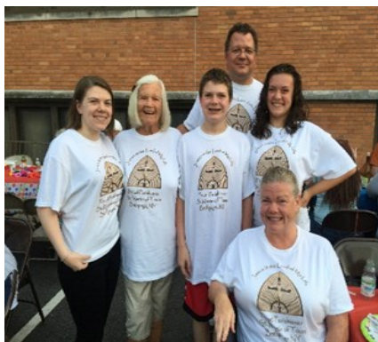
Great Family Pic!