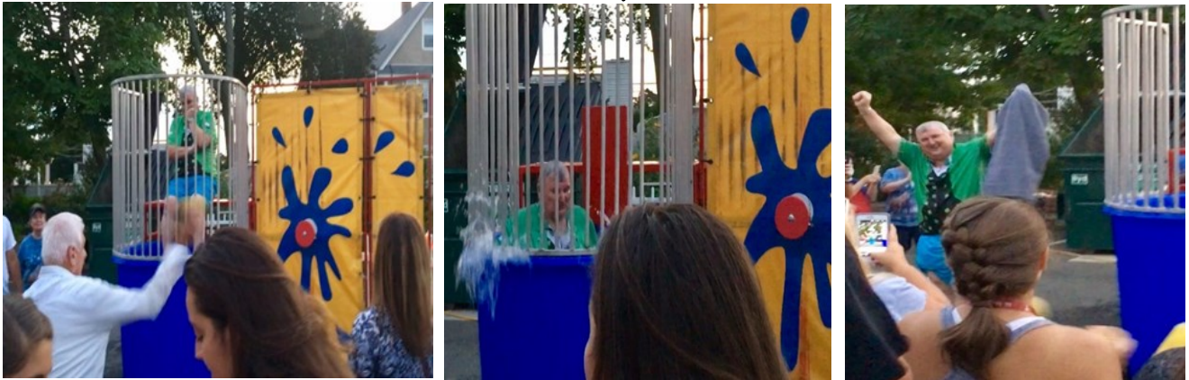
The long-awaited "Dunking of the Pastor!"