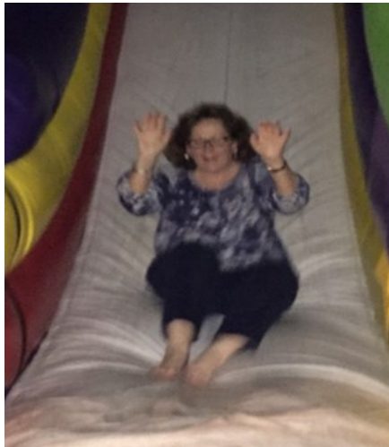
Letting go is the key!