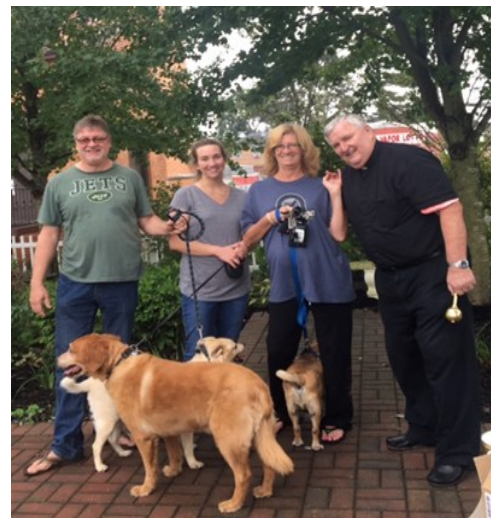
Blessing of the Animals, October 8th in honor of St. Francis of Assisi.

MOMMAS is dedicated to empowering the young women who come to us under difficult circumstances to become loving mothers and responsible parents. After a year or two, the mothers leave MOMMAS, prepared to support themselves and their babies. For more information, call 516-781-8637 or go to the website: www.mommashouse.org