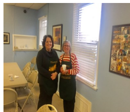
Two St. Clement Bakers