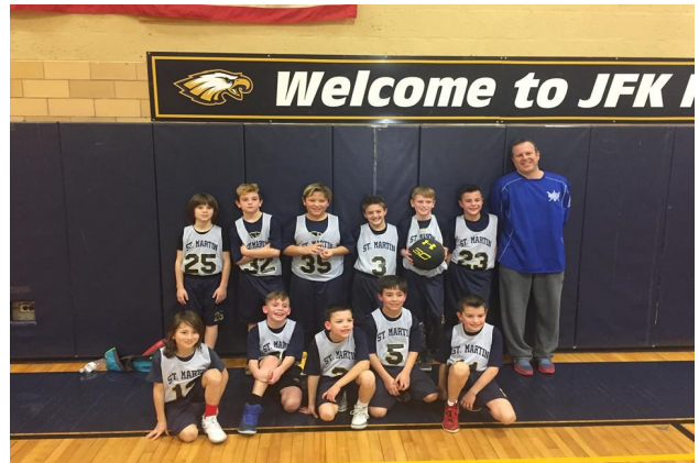
St. Martin of Tours 4th Grade Boys Take Division Title