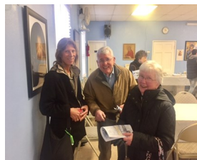
Three Happy Diners!

Thank you, Our Lady of Mercy Academy in Syosset, for donating food from their "Super Bowl" collection - a super thing to do for others!