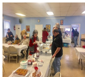
The Knights serving a delightful breakfast