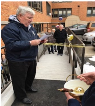
Scenes from the blessing our new accessibility ramp

Creator God, we are your people. We look to the future with optimism and with faith in You, as we pursue our call to provide justice and fullness of life for all people with disabilities. We pray that every man, woman and child may develop their potential and meet You in themselves and in one another. May we enjoy a totally welcoming community, with You as our center, joined hand in hand with our sisters and brothers. We ask this in Jesus' Name. Amen Based on the Pastoral Statement of U.S. Catholic Bishops on People with Disabilities