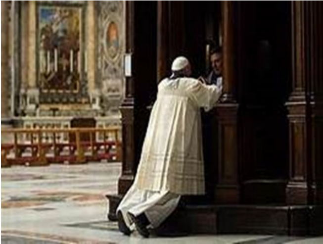
Pope Francis seeking forgiveness in the Sacrament of Reconciliation

A young woman went to confession and in the course of her confession, she mentioned to the priest that she worked for the circus. After hearing her confession and giving her absolution, he was curious and asked her what she did in the circus. She told the Father that she was an acrobat and offered to show him part of her routine. The priest and the young lady stepped out of the confessional and she proceeded to do five summersaults and three backward flips. Two elderly women who were on the line for confession turned to each other and said, if that is the penance that Father O'Malley is giving today, we better get off of his line!