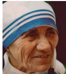
St Mother Theresa Outreach Center St Martin of Tours

“Whatever you do for one of these, the least of my sisters and brothers, you did it for me.”