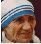
St Mother Theresa Outreach Center St Martin of Tours

“Whatever you do for one of these, the least of my sisters and brothers, you did it for me.”