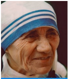
St Mother Theresa Outreach Center St Martin of Tours

“Whatever you do for one of these, the least of my sisters and brothers, you did it for me.”