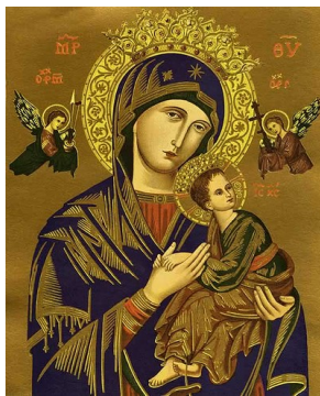
Mother of Perpetual Help hasten to help us!

Living Stewardship ~ Pillar of Hospitality: God is generous to His children. This week be generous and kind to all you meet.